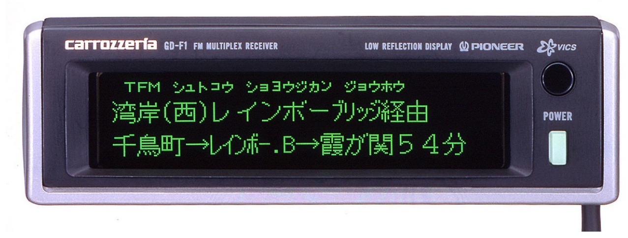
Figure 2 FM teletext multiplex receiver GD-F1