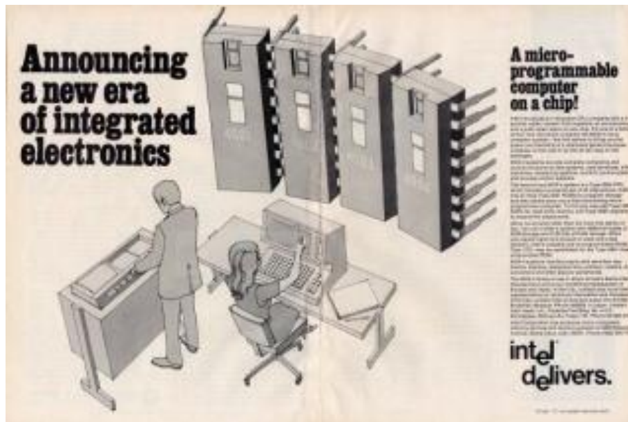
Photo 3.2 Advertisement of 4-bit microprocessor published in Electronics magazine of November 1971 issue. A message tells us the arrival of a new era.

Advertisement (Photo 3.2) published in the Electronics magazine in 1971 was a message telling the arrival of the very new era.